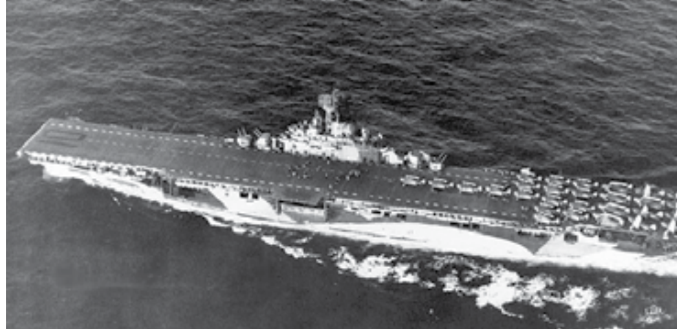
above: Fred as Lieutenant, U.S. Naval Air below: The Yorktown (CV10) at sea